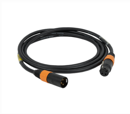
SKU: 14118 Price: $75 USD / 100 CAD XLR crossover cables for the DIT BOX to Panavision VCLX batteries