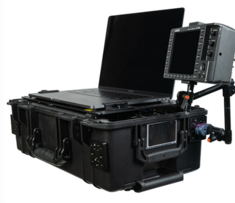
SKU: Multiple Options Rudy Arm - Articulating Arm for mounting onboard monitors/scopes or Iris hand units