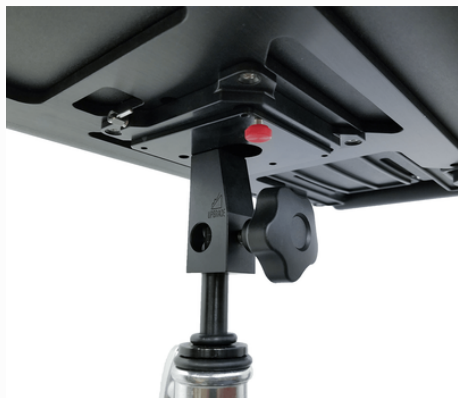
SKU: 12955 Price: $254.25 USD / 339 CAD Quick Release VESA Plates to Spigot Adapter – DIT BOX + Laptop Tray QR Accessory Kit Includes 2x QR Monitor Plates (for DIT BOX Bottom Bracket and Laptop Tray), and 1x Spigot Adapter to QR Receiver Plate