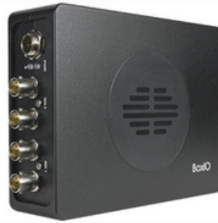
SKU: 14238 Price: $210 USD / 280 CAD Third Box IO: LEMO Power Cable + 5x BNC Cables (BOX IO not included) For users looking to outfit their DIT BOX with a third FSI BOX IO.