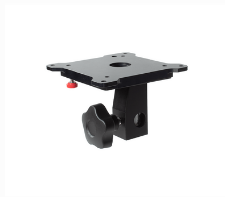
SKU: 12960 Price: $179.25 USD / 239 CAD VESA Quick Release Plate to Spigot Adapter Includes 1x Spigot Adapter to QR Plate