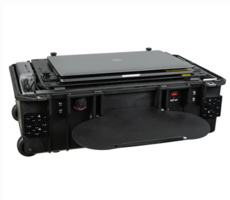
SKU: 13519 Price: $93.75 USD / 125 CAD Bracket for Tangent Ripple Color Wheel